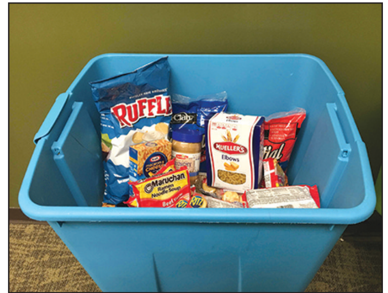
A bin filled with various food items sits in conference room in the Wellness Center.