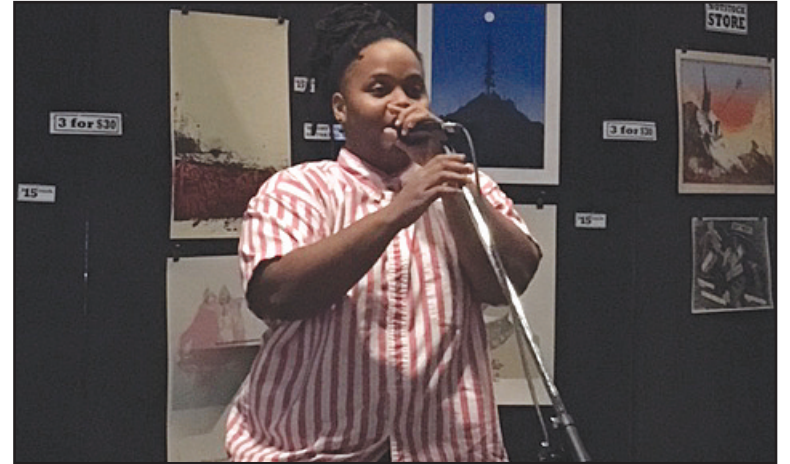
WordStock guest poet Oompa introduces students at the Slam in the Dam. The event was part of NOTSTOCK on campus.