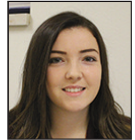
Shelby Tornato Communication Disorders

“The biggest thing would be gun regulation. If they could merely put a restraint on at least automatic weapons, [that is] weapons that could cause mass damage, that would be the best option.”