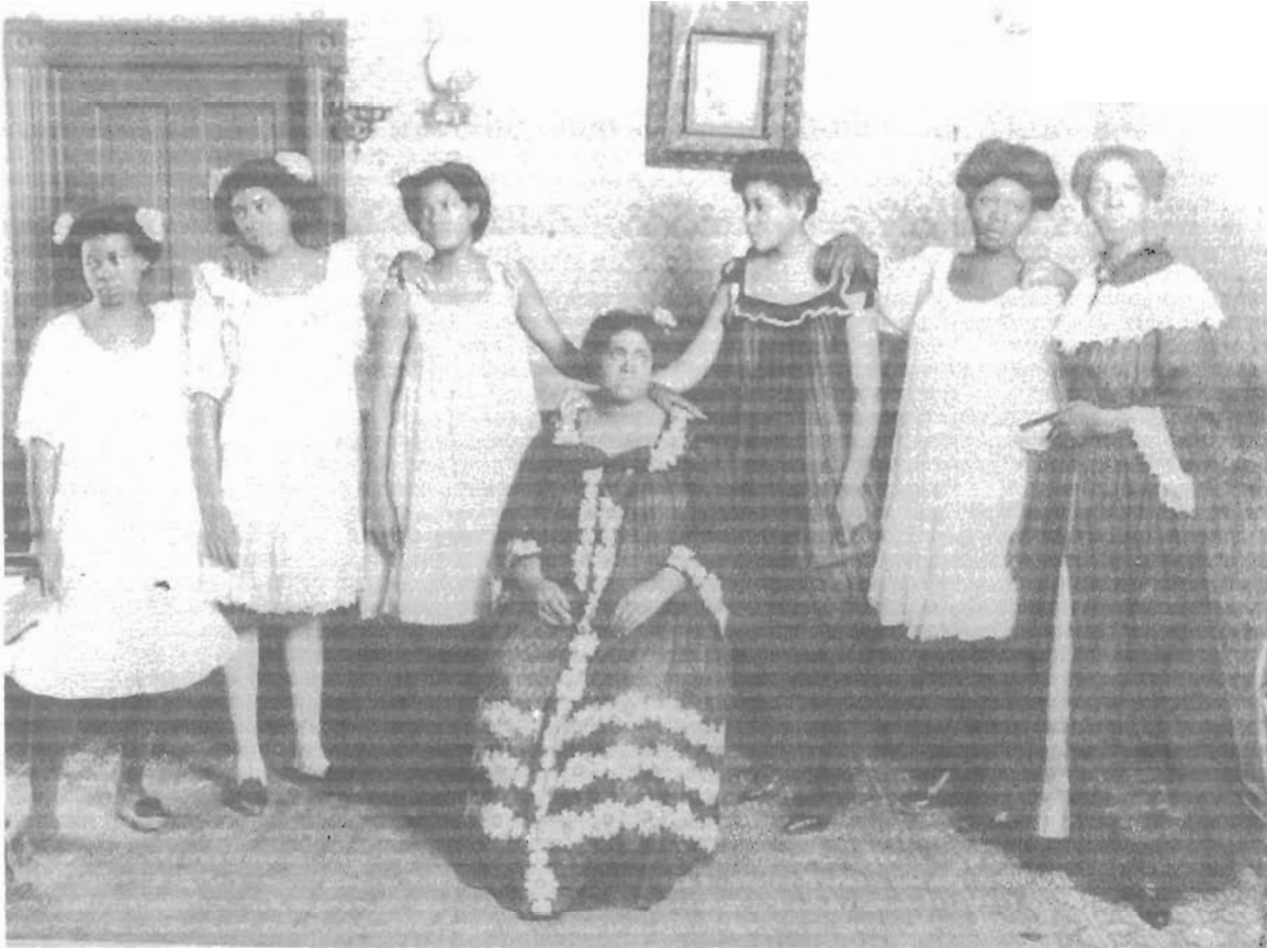
Colored prostitutes, in Kansas, in the early 1900's

street, foundation. I remember looking at it and wondering its history; it looked so out of place. Well, that history is larger than I could have imagined.