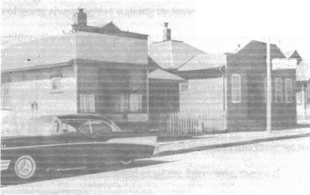
Avalon photo courtesy of the City of Minot, Assessor's Office

This area of town had a rhythm life was different than that of the rest of town. This is where people went after the main street merchants closed. It was open 24 hours a day, but flourished in the night. The daytime was filled with sleepy days, laundry ladies, and shopping sprees. These folks had their community where they loved, lived and fought as any other segment of