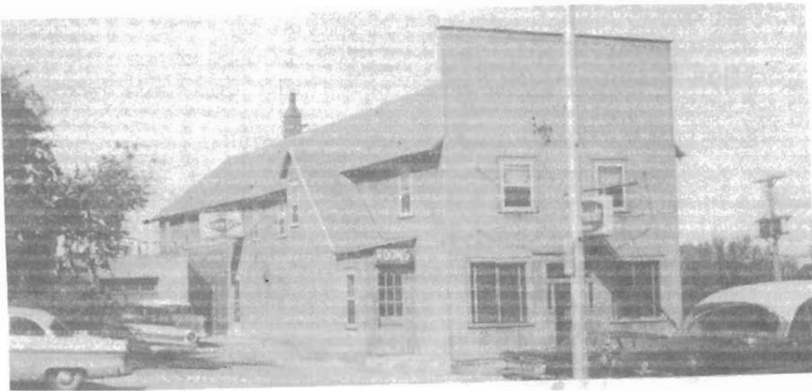
Vendome Bar