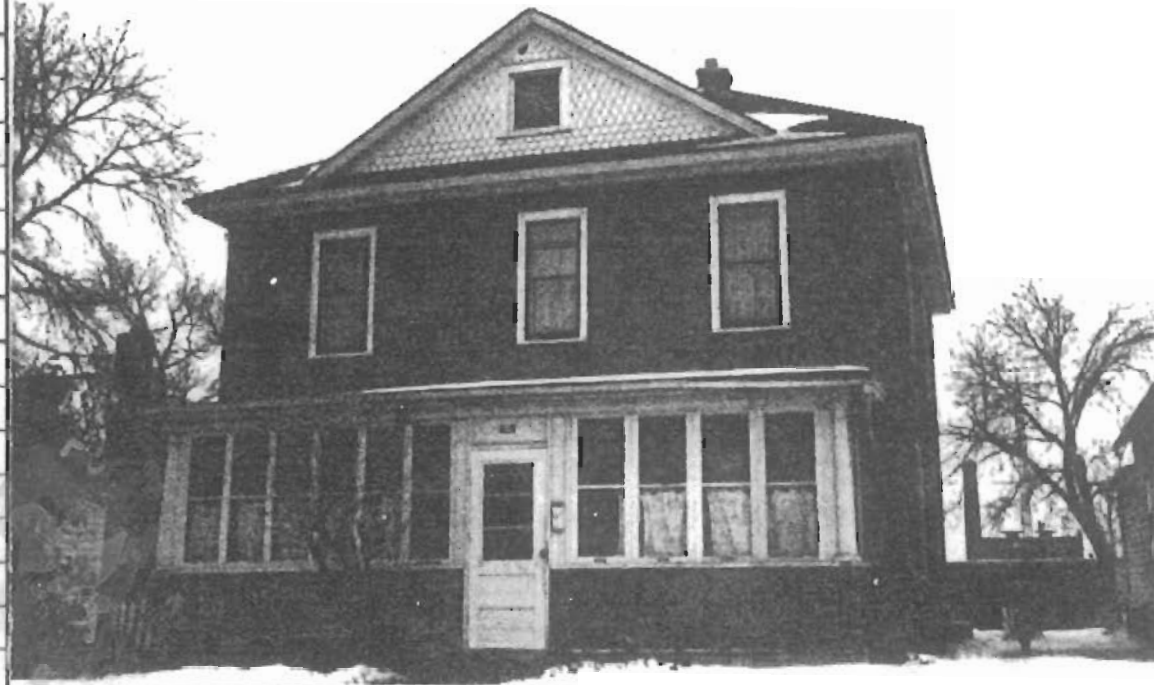
This photo, courtesy of the city of Minot Assessor's Office, shows the glass porches where the girls would tap the glass with a coin to show their availability. 1