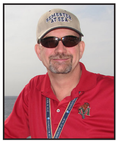
Girard on previous SAS journey

Hey students, do you feel like you can't fit the traditional semester-long Semester at Sea® experience into your life right now? Well, there is another option for you!