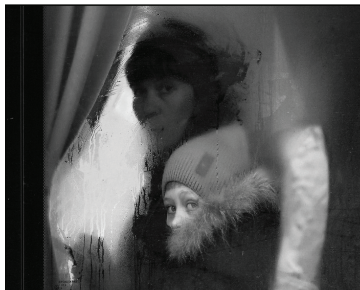
Refugees fleeing Ukraine.