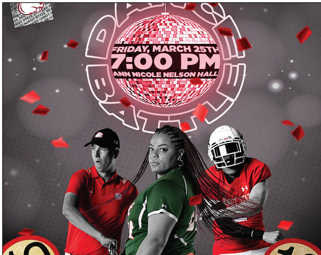
After a hiatus due to the COVID-19 pandemic, the Lip-Sync Battle returned to Minot State's campus on March 25.

In the end, football was the 2022 lip-sync champions. Lets see if they can keep their title next year.