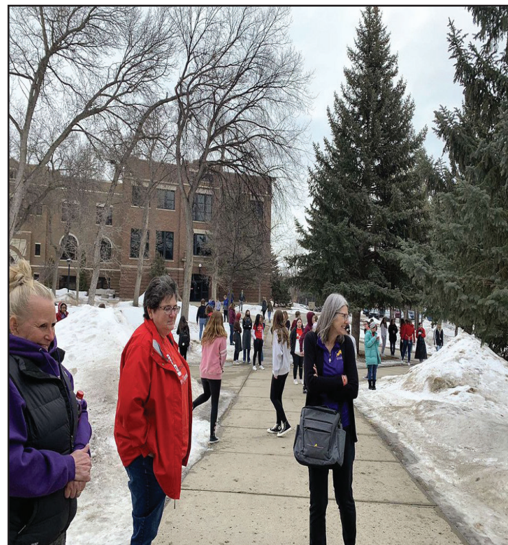
Regional middle and high schoolers competed at the Science Olympiad held on Minot State's campus on March 14.

Overall, it was a very successful event, and the science department was very efficient in organizing and making sure the event was a success. We look forward to the next one in a year.