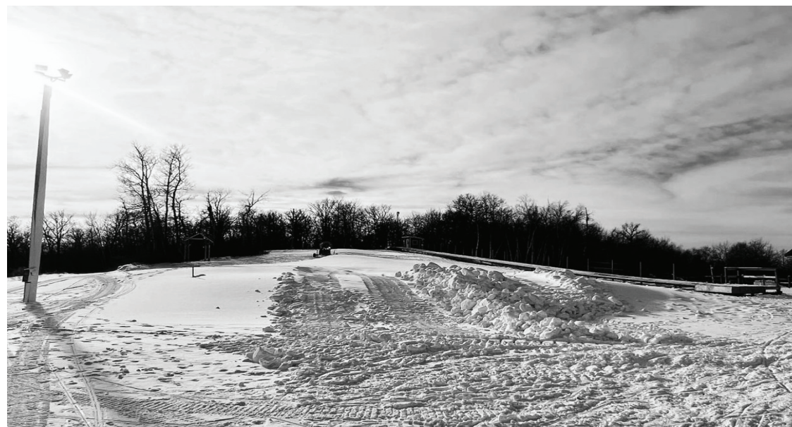
Bottineau Winter Park is located in the Turtle Mountains of North Dakota.

Students should look out for travel opportunities like the Bottineau trip. Follow the MSU Wellness Center on social media to stay in the know of any great ways to spend holidays doing fun activities.