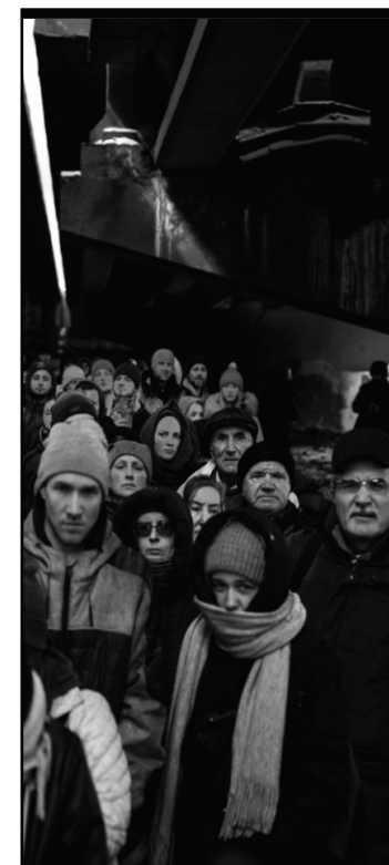
Refugees fleeing Ukraine.

Hopefully, the talks between the presidents of either country lead to a good faith ceasefire and, eventually, an end to the conflict.