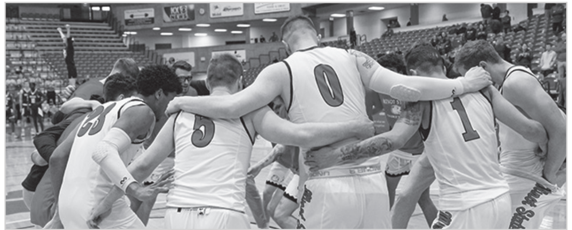
MSU men's hoops had their season come to an end in the first round of the NSIC conference tournament. The Beavers fell to the Mustangs of Southwest Minnesota State University on Feb. 23 at the MSU Dome with a 89-75 loss.

Although this chapter has closed and multiple key players that may be considered some of the best in MSU history are done, the future for Minot State looks promising.