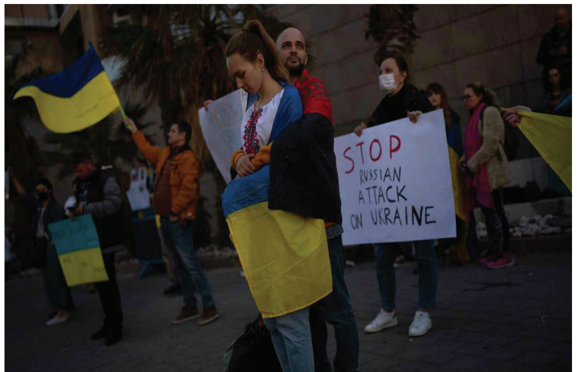
Protests in Israel against the invasion of Ukraine.

As the days go by, more information starts to unfold on the status of this war as attacks increase and more citizens become refugees. We don't know if Putin will stop at only Ukraine or go further to neighboring nations, including those under NATO. If this happens, the United States will have to get involved as it is a NATO nation. We hope that this de-escalates as unexpectedly as it started but until then, we can only sit and watch.