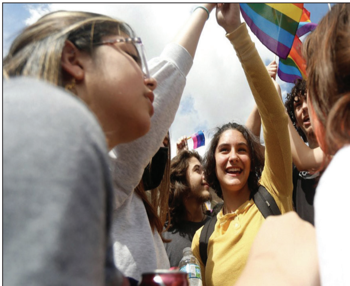
The "Don't say Gay" bill prompted Florida students all over the state to lead schoolwide walk outs in protest of the new bill.

Democratic news outlets all agreed that this bill represents the smaller parts of a larger political Republican attack.