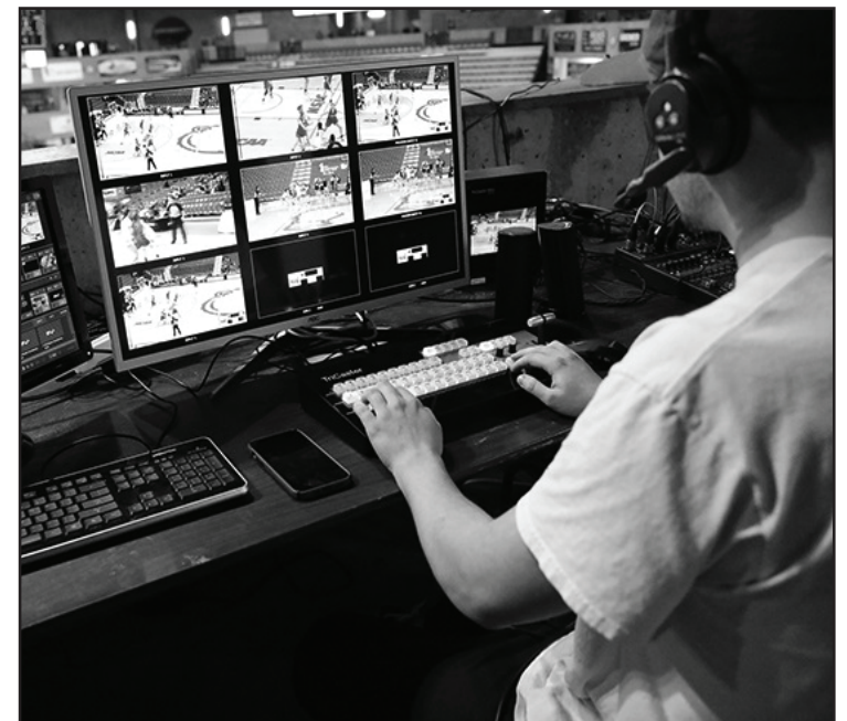
Every spring semester, the professional communications department live broadcasts a double header of the men's and women's basketball teams.

When diving deep into this production you realize how big it actually is, and these students did it all, thanks to the amazing professional communication department here at Minot State.