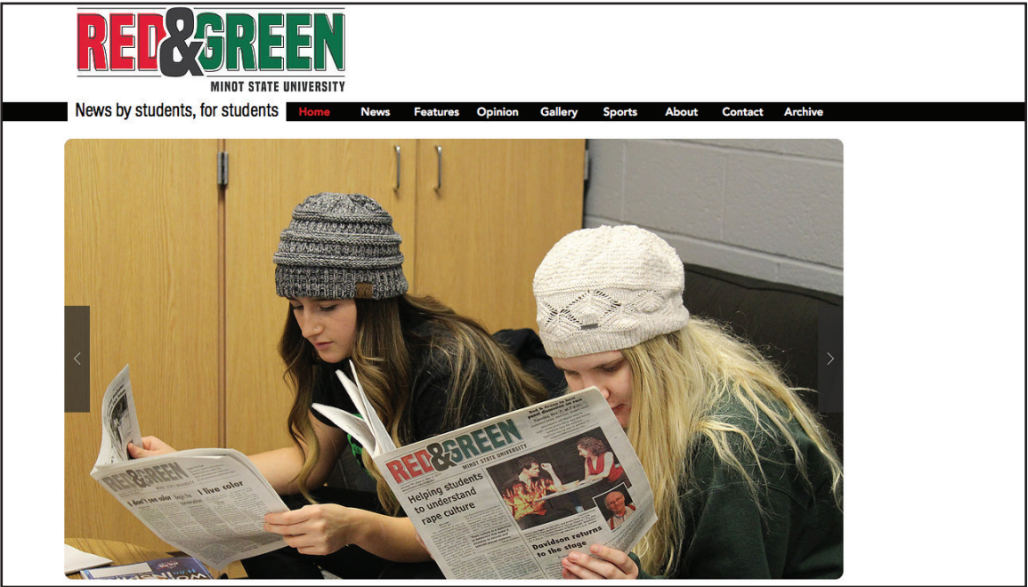
The Red & Green’s website, RedGreenPaper.com, offers original content to provide students with more local and campus news.