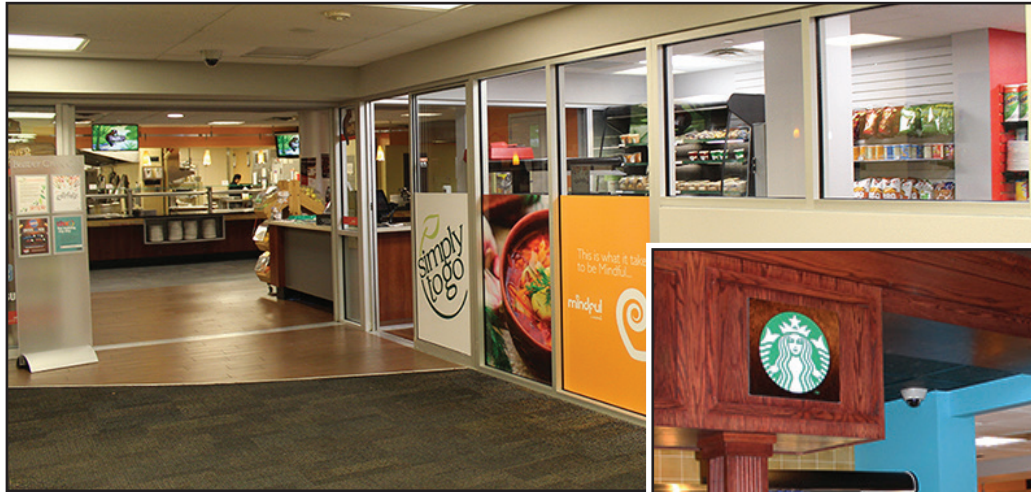
ABOVE: The new, expanded C-Store offers more options for those needing to grab a quick lunch or snack.