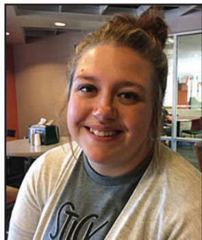
Jackie Rockeman Elementary Education

"The late-night hours. I like the fact that they are open until 1 a.m. because it's nice to have the option for those who need it."