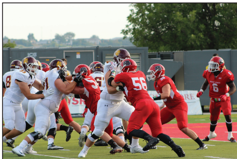
The Beavers' defensive line works to hold back the Bulldogs. The Beavers are back at Herb Parker Saturday to face University of Mary at 3 p.m.