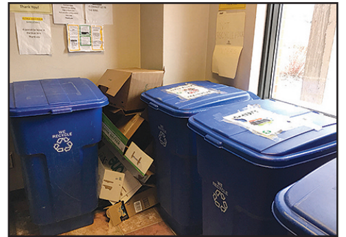
Several recycling bins line the east end of the Administration Building, first floor.