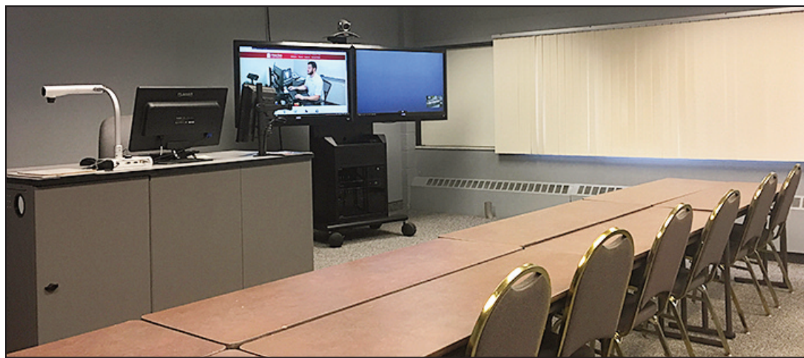
MSU students propose offering college courses to prisoners in Bismarck via IVN technology.

Hatfield breaks record in weight throw, Page 8