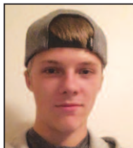
Garrett Dahle Management

"My favorite memory of Halloween growing up has to be carving pumpkins with my family."