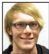
Ward Lamon Staff Writer