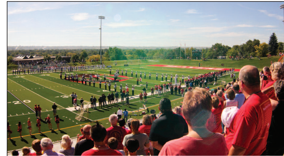
The MSU Marching Band performs the national anthem to a full house prior to Saturday's game at Herb Parker Stadium.