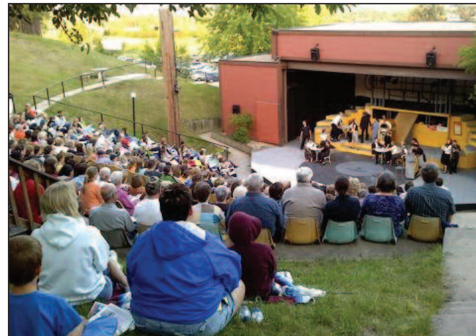
Summer Theatre cast members performed for a sold-out crowd last year. This year's 46th season begins June 14 and ends July 23.