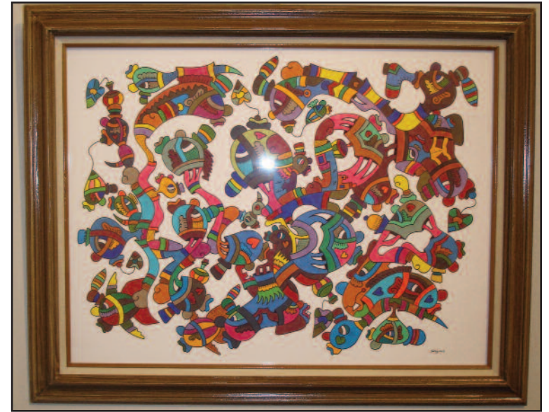
"Your Mind Wanders," one of 29 pieces by Bill Nybo, is on display in the Library Gallery.