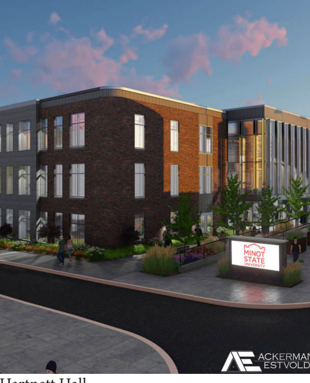
Hartnett Hall

ule tours through the Hartnett Hall Scheduling site. These tours are scheduled for every