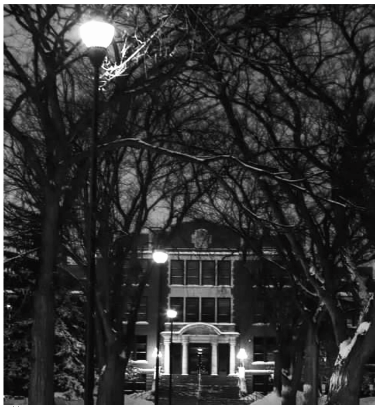
Old Main

Minot state has recently basic English, math, science and social science in high school. Having Minot State is a very welcoming university that is open and ready to admit as many students as possible and is willing to offer financial support to students who need it. It is certain that Minot State University follows through its mission statement of education, diversity, and a vibrant campus life. It is no surprise that Minot state university has been recognized as one of America's best colleges.