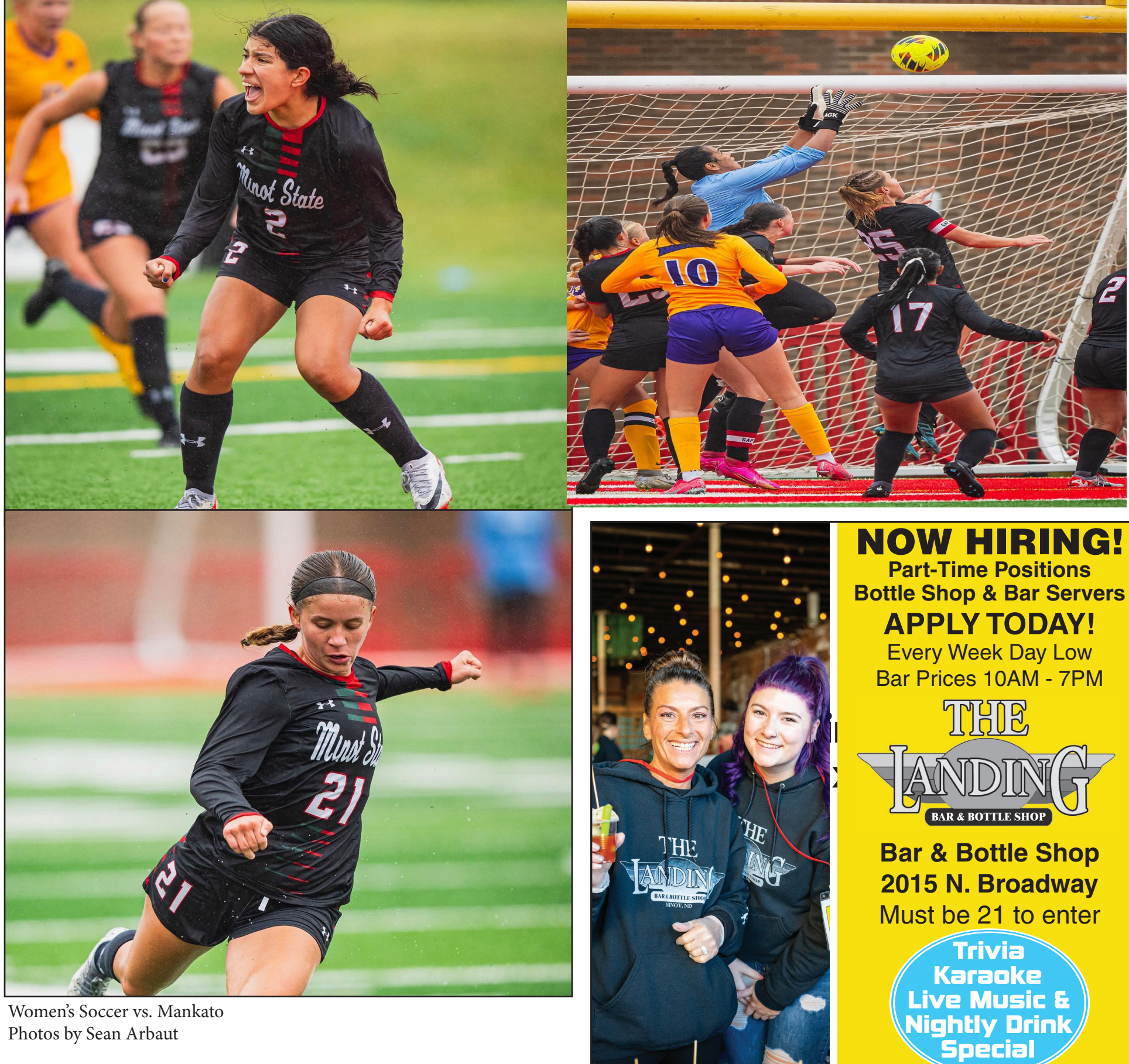
Women's Soccer vs. Mankato