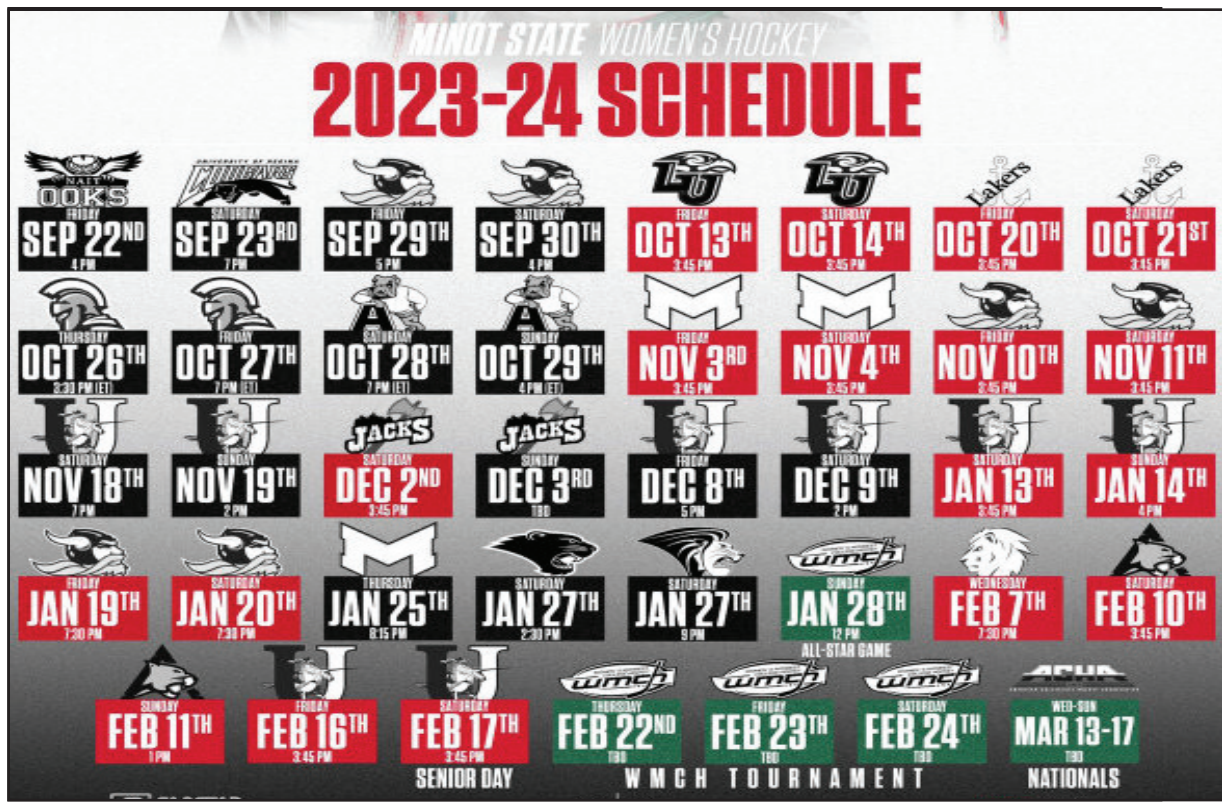
MSU Women's Hockey begins its campaign an for ACHA Title on September 25th.