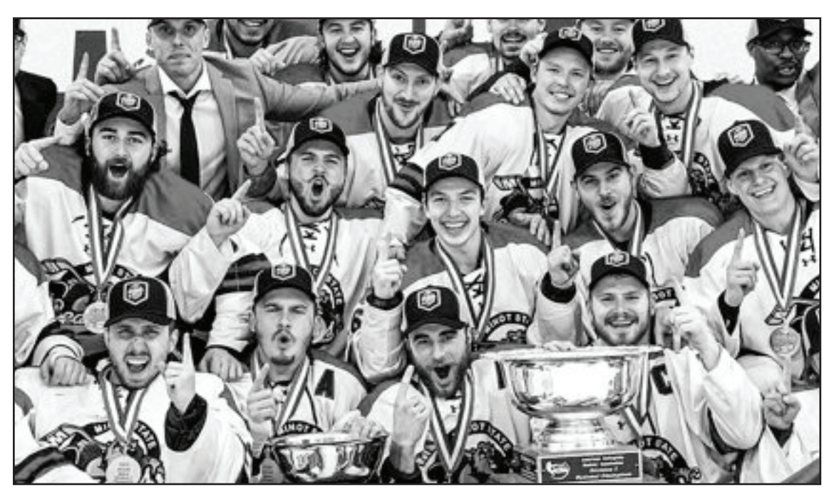
MSU Men's Hockey begin their title defense as reigning ACHA National Champions this fall.

The Minot State Men's hockey team will be having their home opener on September 29th where they compete against Liberty University on that Friday and Saturday. During that weekend, the men's team will be having their 2023 National Championship banner raised. "By raising that banner in front of everyone will be such a special night not only for us but also for the fans."