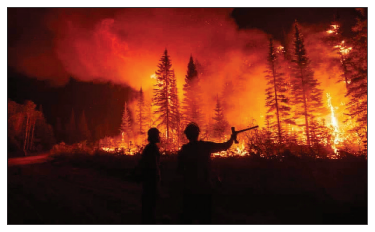
Fires raging in Canada