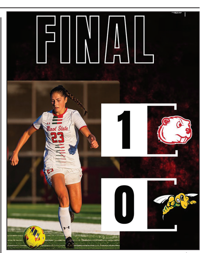
MSU Women's Soccer earns a 1-0 Victory over MSU-Billings.