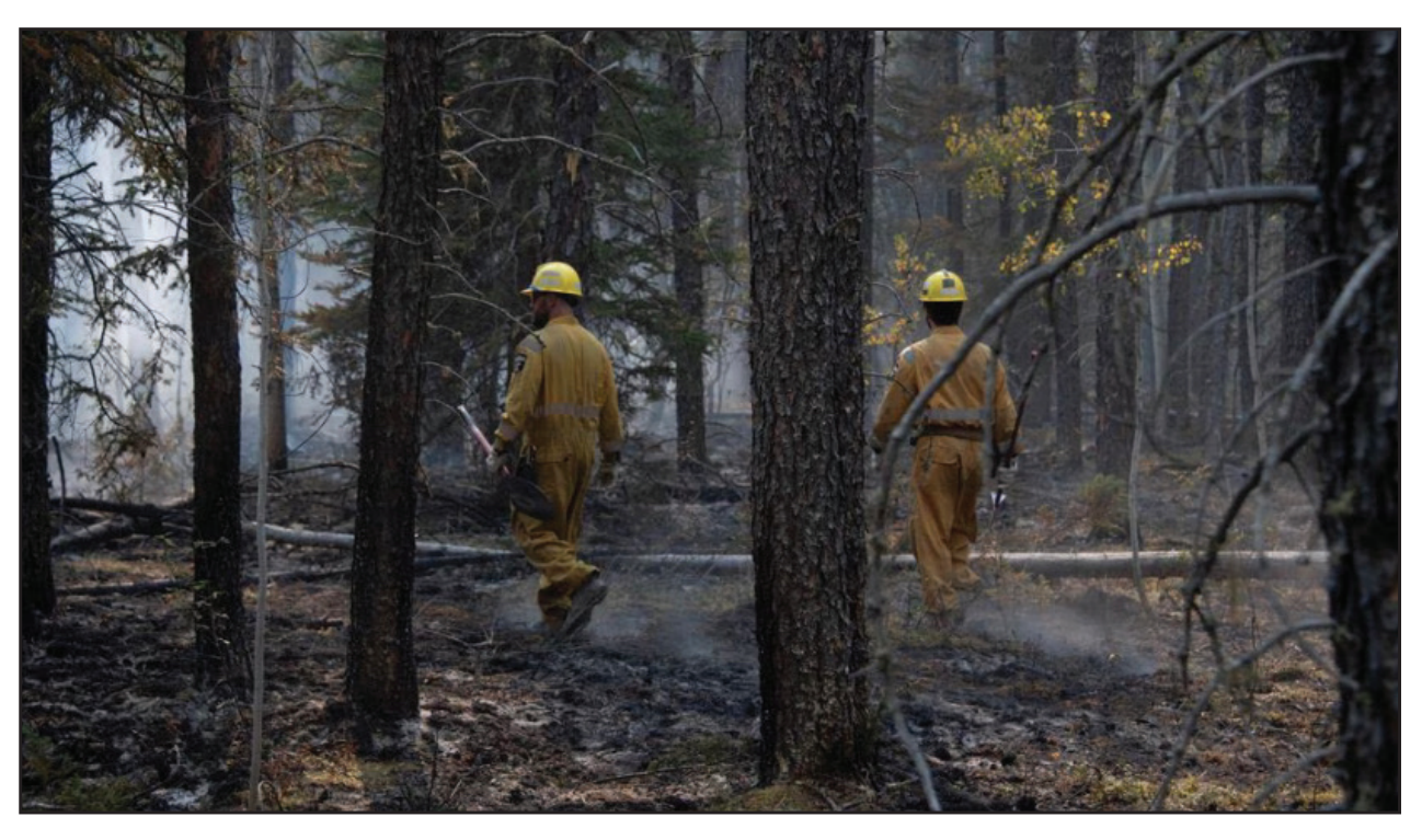
Firefighters in Canada

It is important for Minot State students to become aware of this issue, and hope for the best in the next months to come.