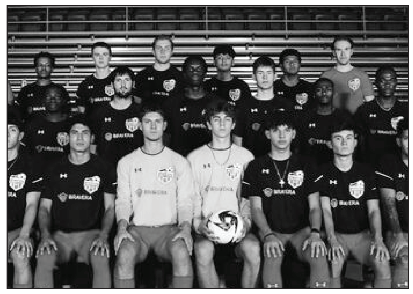
Minot State's newest club sport team, MSU Men's Soccer, debuted this fall at Herb Parker Stadium.

a great victory over NDSU who were the 8-time champions in the conference. Their hard work and dedication to the team and the sport drove them towards victory.