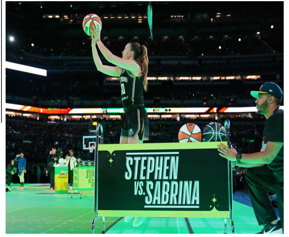
Ionescu shooting