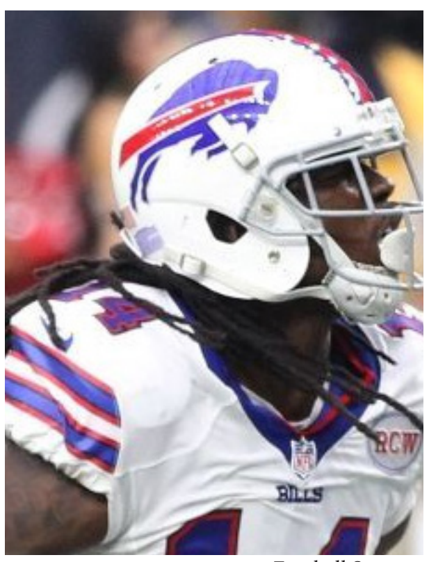
Football Star