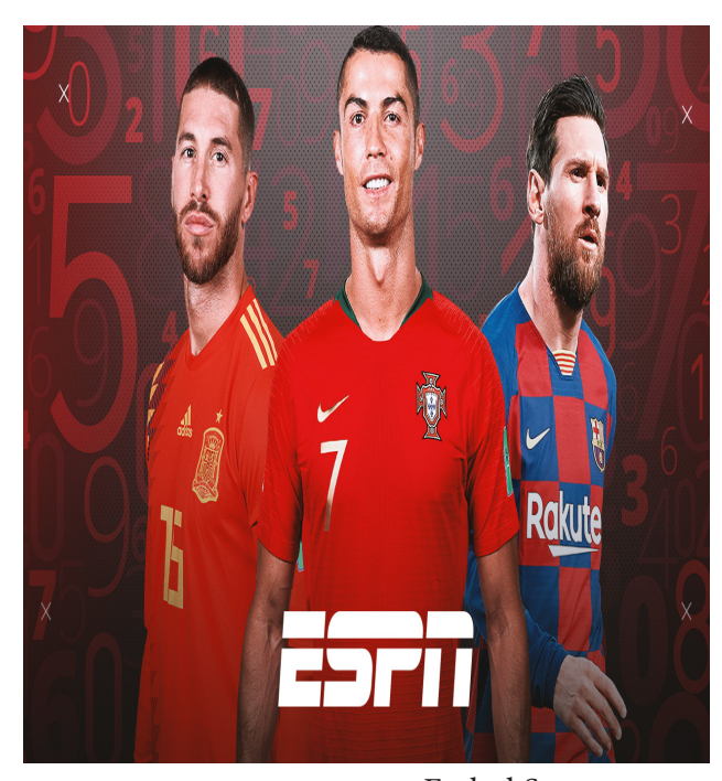
Futbol Stars

The next time you have an argument with your friends on whether football is better than soccer, remember, football is Americas favorite sport, but fútbol is the world's favorite sport.