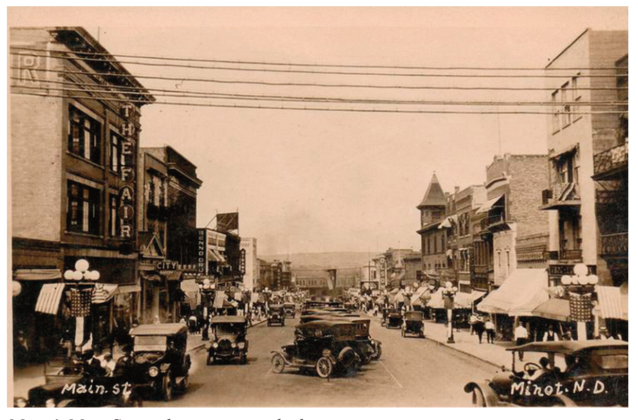
Minot's Main Street shown in its early days.