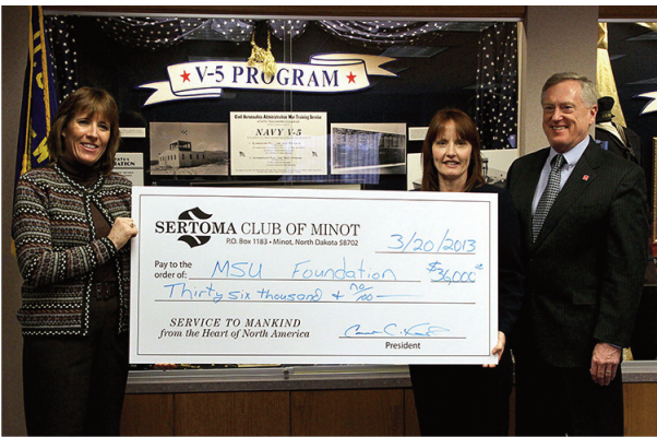
Above: Minot Sertoma Club members and MSU faculty and students pose following the check presentation.