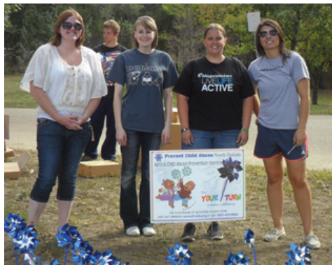
Undertaking a service project for the flooded North Dakota Prevent Child Abuse agency, SSWO students placed 1,000 pinwheels in Oak Park Sept. 4. The pinwheels represent 1,000 North Dakota children born annually to abusive families.

Thursday (Sept. 6) at 2 p.m., the National 9/11 Flag, which flew over the World Trade Center wreckage site, will arrive by motorcade at Minot State University's Old Main for unfurling and public viewing. Destroyed in the attack and stitched back together by disaster survivors, the flag contains pieces of retired American flags from all 50 states and exemplifies the American people's resilience. The community is invited to attend and to wear patriotic colors. Police