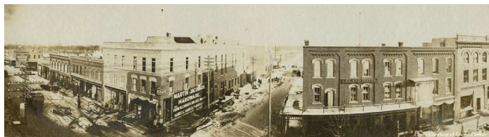
Minot, North Dakota, 1902

Minot State University students, faculty and staff are admitted free with a current ID. Additional tickets for adults are $20. The price for senior citizens is $15 single; students 12-18, $10 single; children, $5 single.